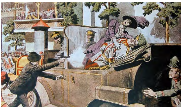
Assassination of Franz Ferdinand in Sarejevo 1914